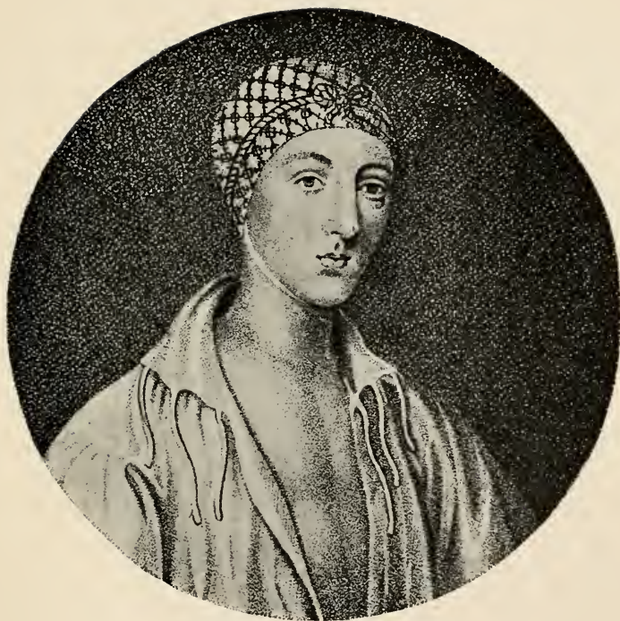
THE DUKE OF RICHMOND