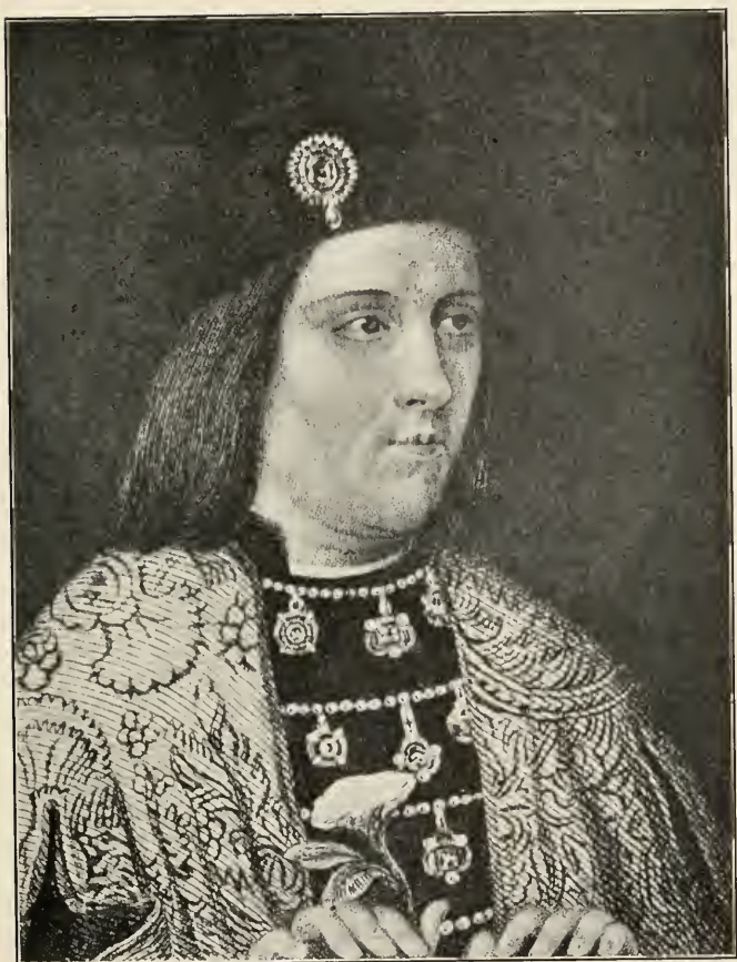
EDWARD IV AS A YOUNG MAN