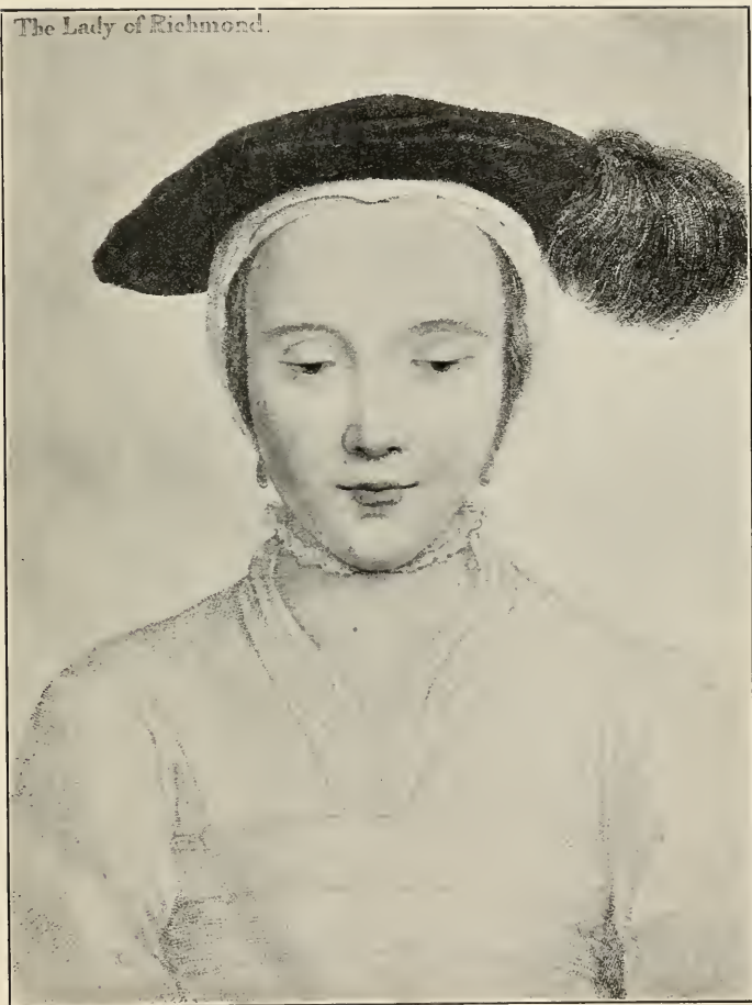
THE DUCHESS OF RICHMOND