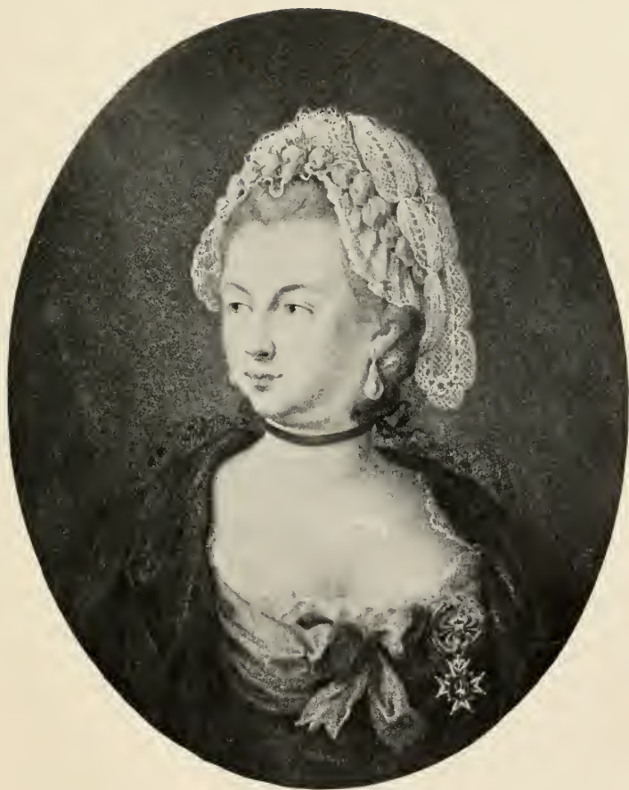
THE CHEVALIER D'EON