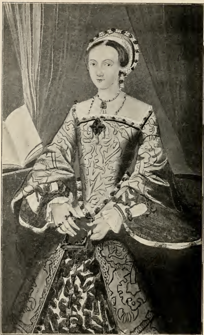
QUEEN ELIZABETH AS A YOUNG WOMAN